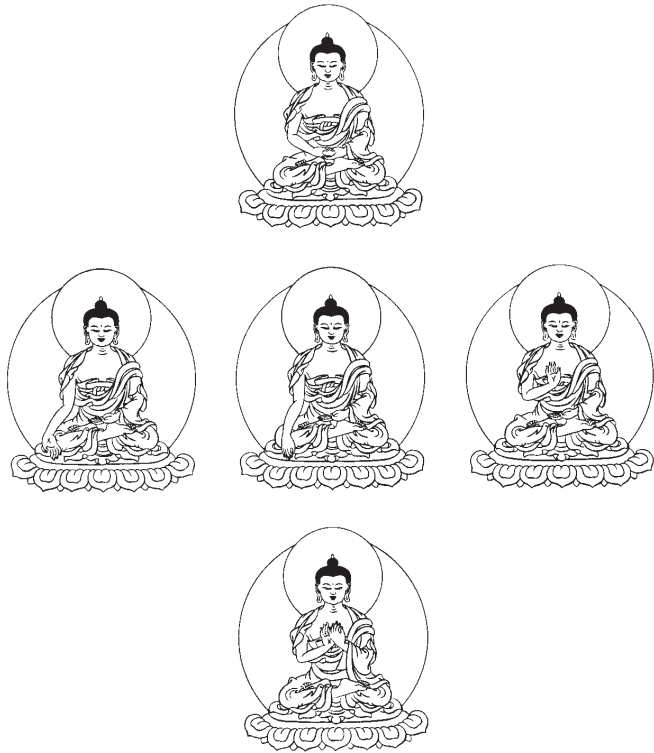
The Five Dhyani Buddhas